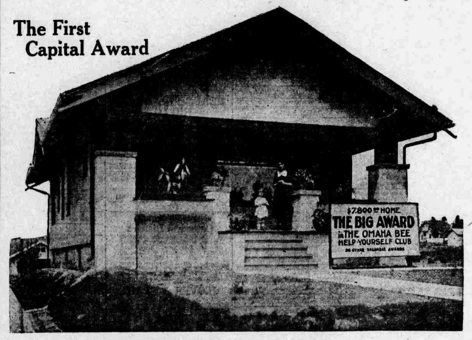
A $7,800.00 Martin-Built Home at 2578 Titus Ave.

$29,450.00 in Value Given by The Bee Help Yourself Club -One More Day Decides Their New Ownership