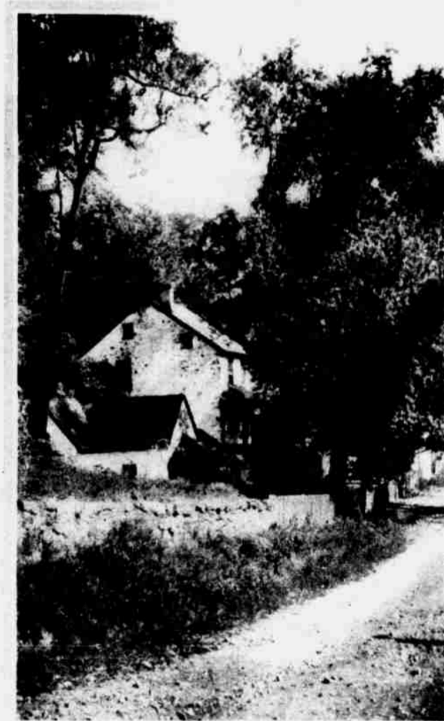
Made with Vest Pocket Kodak, Special, Kodak Anastigmat Lens, f.7.7 . Enlargements of this size are 15 cents.