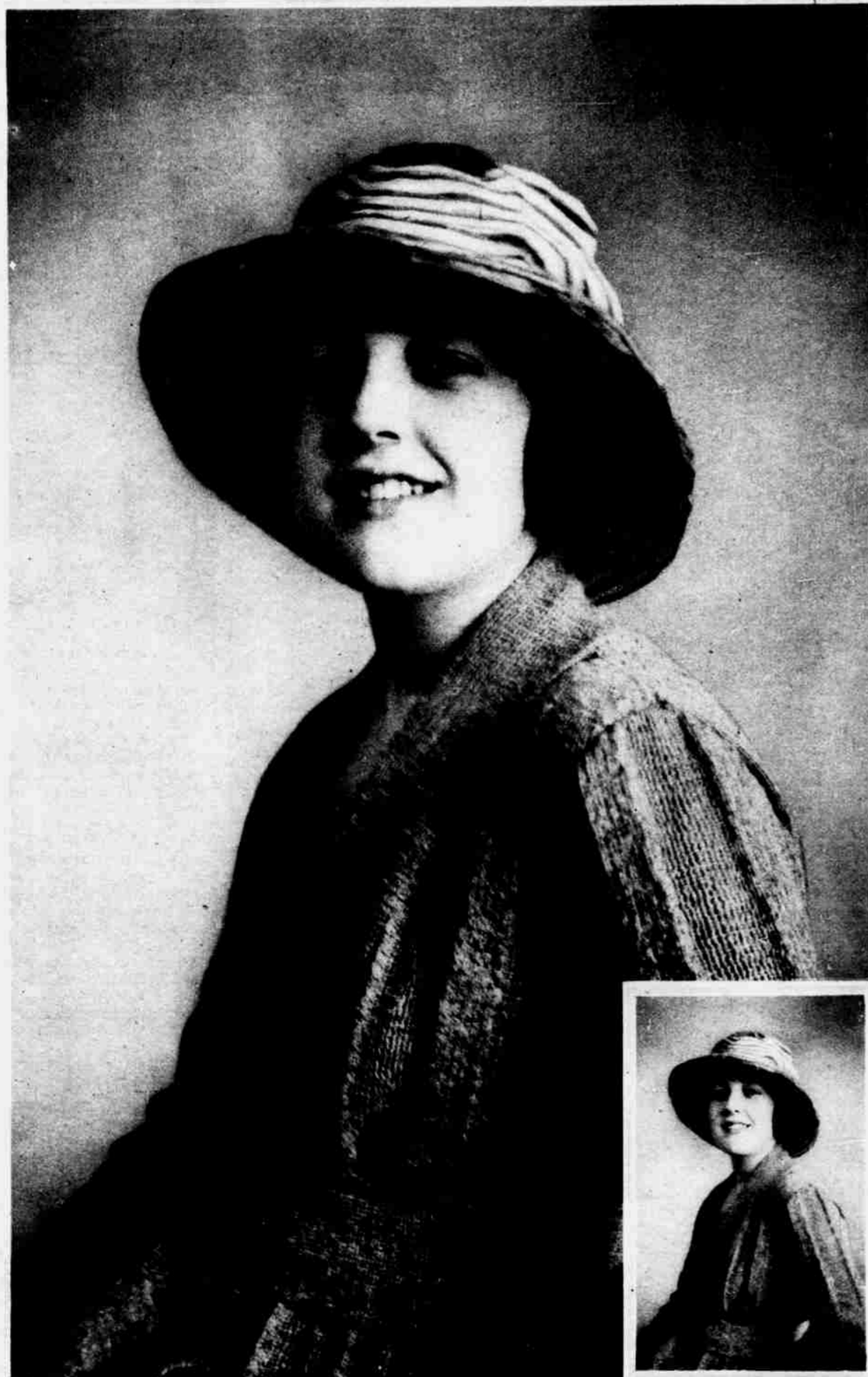
Showing the original Vest Pocket size and the Kodak Anastigmat quality which permits of successful enlarging. A Kodak Portrait Attachment was used in making this picture.

The Kodak Anastigmat Lens f.7.7 with which this model is equipped is of our own manufacture, designed and made solely for use on this camera. The idea back of this lens was to so equip a Vest Pocket Kodak that it would make negatives of such extreme sharpness that satisfactory enlargements could be made in any size. It has justified the work of our optical experts. It produces negatives of that crispness and sharpness characteristic of the true anastigmat.