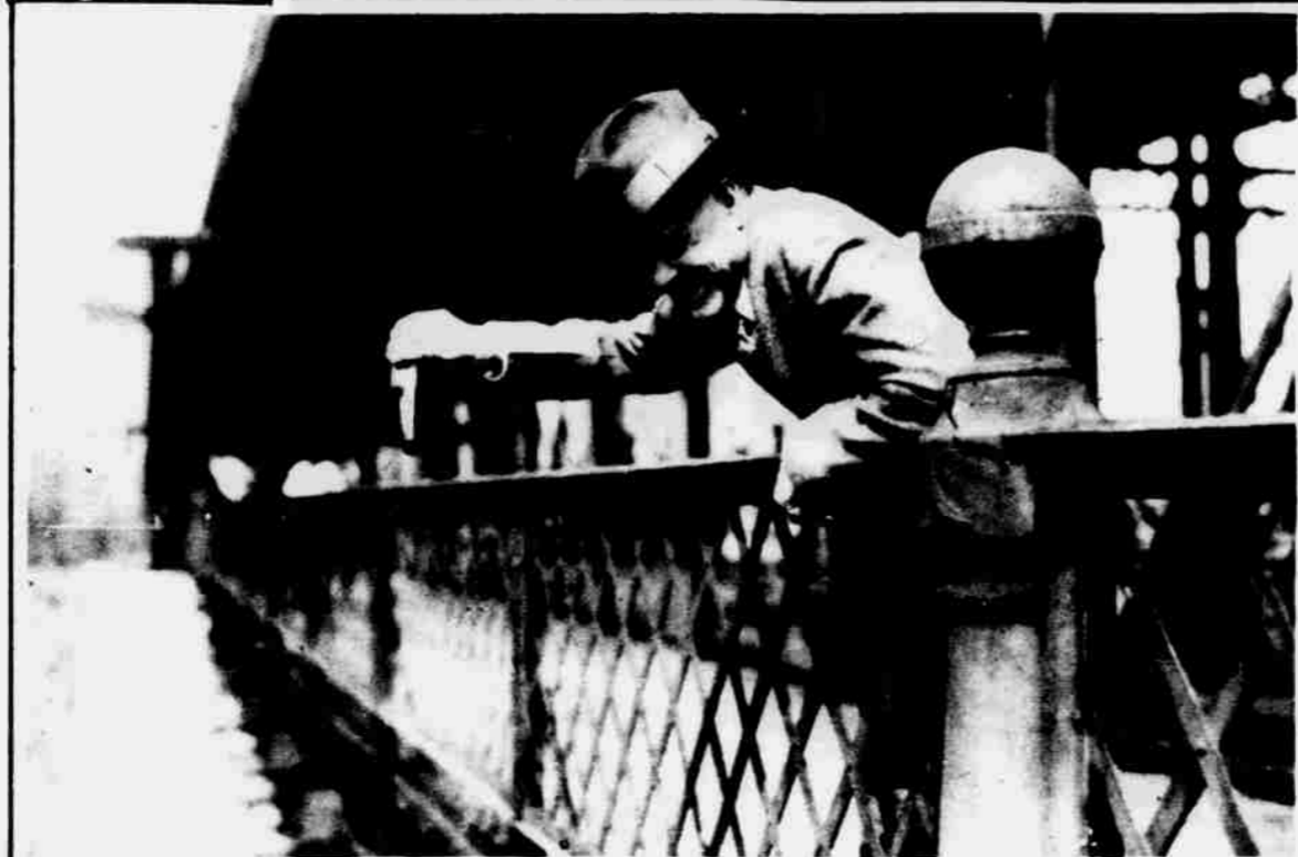
BILLY SUNDAY HELPS MAKE CIN- CINNATI DRY. Here's the well- known evangelist joyously assisting at the last sad rites of a sample of home- brew. Several police autos were required to carry the contra- band to the "bridge of sighs," where Bil- ly smilingly helped the brewers still it overboard in Mill Creek.