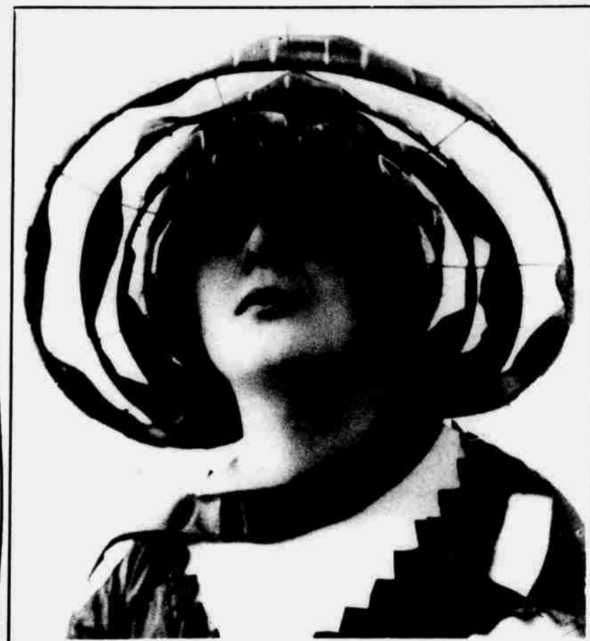
A PINWHEEL CHAPEAU, a self ventilating Parisian novelty in summer headwear that helps answer the question, "What's the latest in French millinery?" Buy a wire lampshade frame, a few kilometers of your favorite ribbon, tack one end of the ribbon to the wire and start winding, and after a bit of millinery pyrotechnics you have your bonnet. Mirzoff