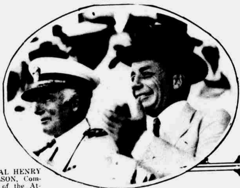
ADMIRAL HENRY B. WILSON, Commander of the Atlantic Fleet, and Assistant Secretary of the Navy Theodore Roosevelt add their whole-hearted applause to that of more than ten thousand gobs at the baseball game to decide the fleet championship held at Guantanamo, Cuba, just before the mighty armada is reviewed north to be reviewed by President Harding.