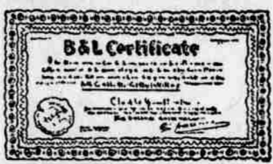
$1,500.00 B. & L. DEPOSIT