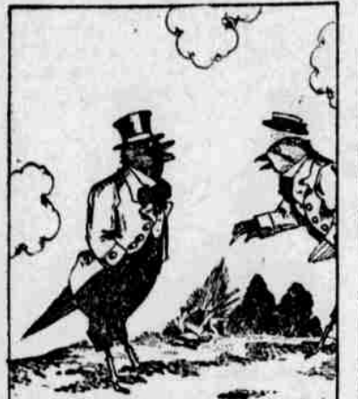
"You know," he added, "we haven't been introduced."

CHAPTER XXI. How to Take Bad News. For once Bobby Bobolink's heart seemed to come right up into his mouth.