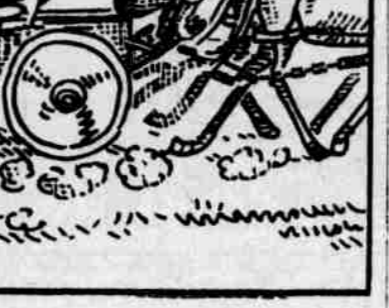
sitting as far up in the front end of the wagon as he could get.