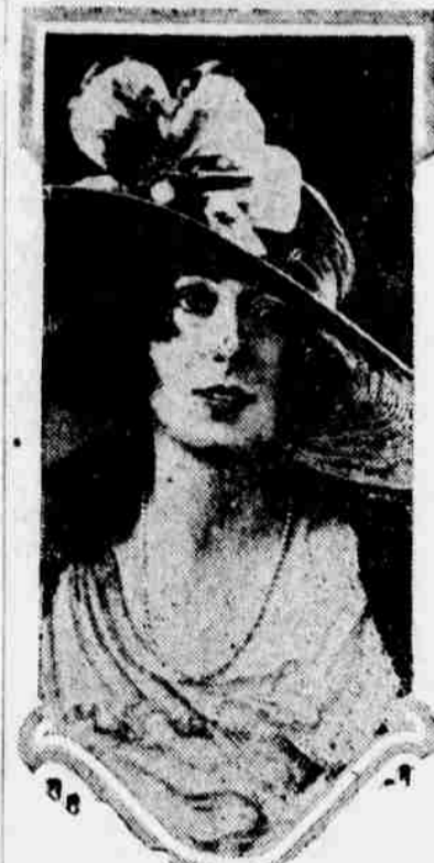
Mrs. Rosita Forbes.

Mrs. Rosita Forbes, recently received by King George, is the first white woman to reach Kufra, the Senussi fastness across the Libyan desert, placing her in the front ranks of explorers. She traveled from Benghazi across the Libyan desert to the oasis of Kufra, the headquarters of the Senussi never before visited by a white woman, and only once by a European (Rohlfs) over 40 years ago. The journey was one of great hardship and danger, due chiefly to the fanaticism of the Zawais, a native tribe who hate strangers.