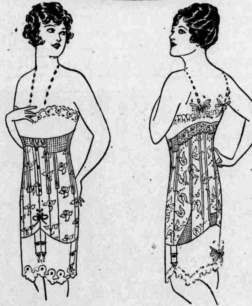
Back Lace or Front Lace

Notably new. Admittedly chic. Unmistakably fashionable. Supremely comfortable. Easily Obtainable at Leading Stores.