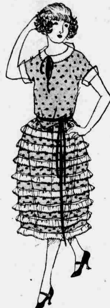
By CORINNE LOWE.

New York.—(Special Correspondence.)—Surely sackcloth and ashes have lost all penitential sound. For nothing is more popular than the loose fitting coat, and, for the second, well, why resist discipline when it's only ashes of roses? This tone is one of the favored tints of a cotton frock season which favors beige, salmon, and tangerine.