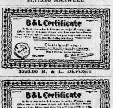
Figure this thing out in dollars and cents and you will see the reason it pays and pays big. First of all, turn to page 7, where the Standing of Members is shown. Does the record show that there are members actively working in your community? Even if there are, you can

Don't let this big opportunity slip by you. If you knew what we know, you would not.