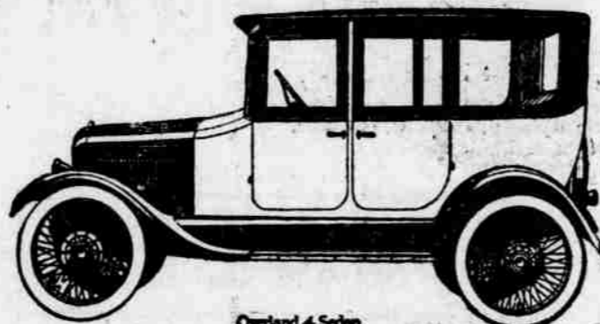
$1,625 Overland 5-Passenger Sedan, purchased from Van Brunt Automobile Co. Five wire wheels. Body, Overland blue; fenders, wheels, hood and top, black.

Group 2, consists of the four country districts, Numbers 5, 6, 7, 8.