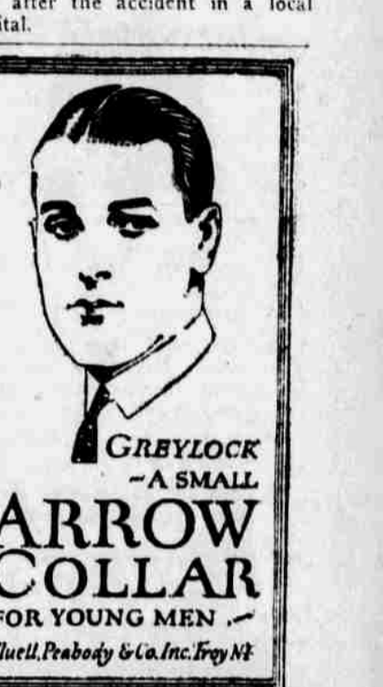
GREYLOCK - A SMALL ARROW COLLAR FOR YOUNG MEN