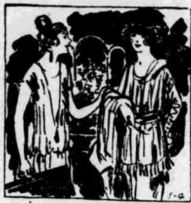
A correspondent in Lowell (Mass.) asks: "When invited for a weekend visit, does the guest or the hostess provide towels and toilet articles? Does the guest carry her own baggage if there is no servant?"

The guest should pack her own toilet articles, although a careful hostess always keeps her guest-room supplied with comb and brush, talcum powder, manicure implements, etc., in case the visitor should have forgotten any of her toilet appointments. The hostess is supposed to provide towels, but sometimes laundry returns are not to be depended upon, especially in the country, so it is just as well for the visitor to pack at least two towels, in case these may be required. Unless the hostess is old or feeble, no protest should be made when she carries a suitcase to the guest-room as shown in the illustration. It is her place to do this, if there is no man about, or if there is but one