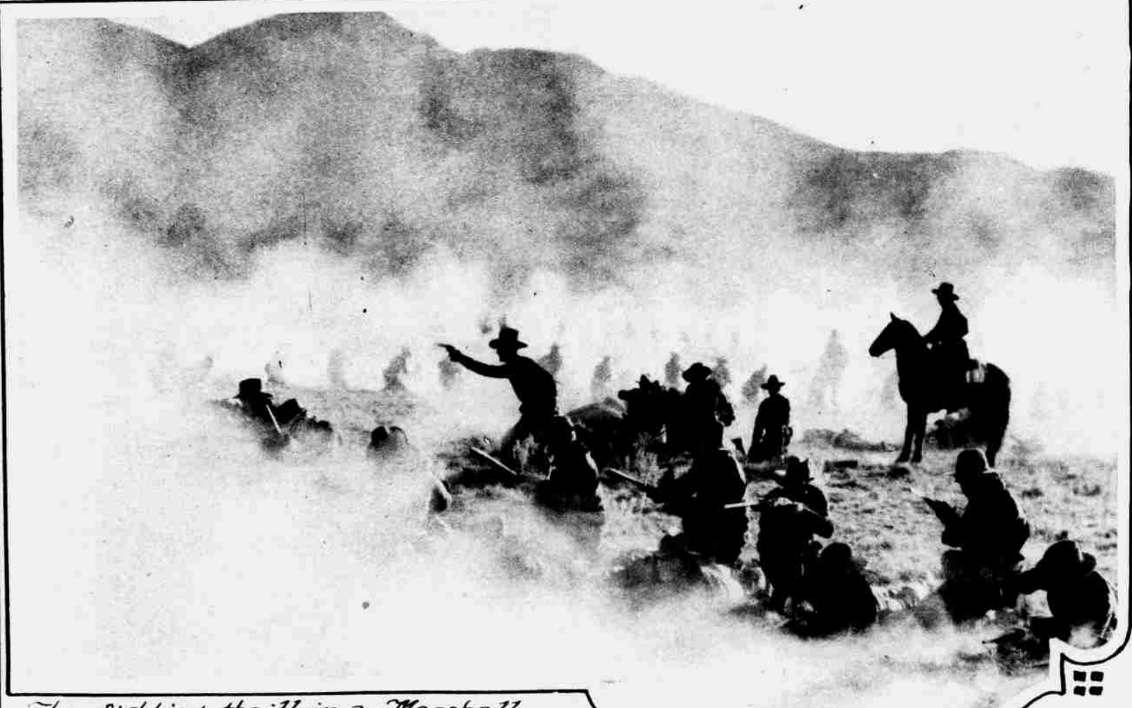
The fighting thrill in a Marshall Neilan production