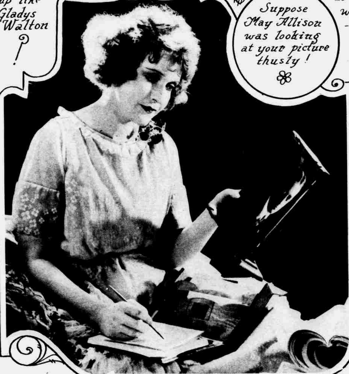
Suppose May Allison was looking at your picture thursty!