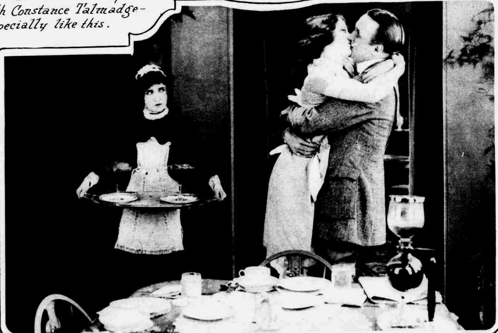
How would you like to play opposite Viola Dana?