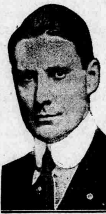
Previous Public Service: Attorney Federal Land Bank, Member State Legislature, 1917, Census Enumerator, 1920.

He is Clean He is Capable He is Fair He is Courageous He cannot be "Handled"