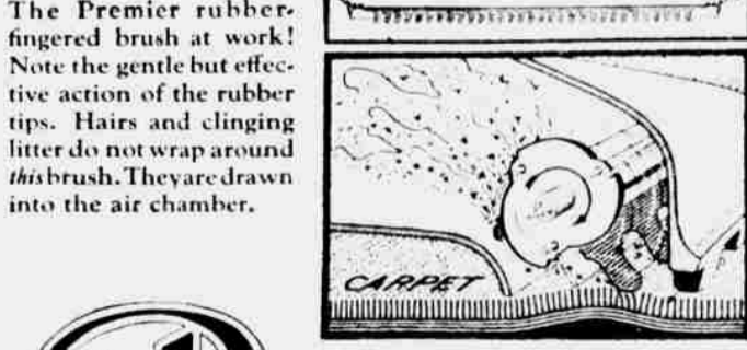
The Premier rubber-fingered brush at work! Note the gentle but effective action of the rubber tips. Hairs and clinging litter do not wrap around this brush. They are drawn into the air chamber.

Learn the advantages of the Premier's specially designed bag, self-balancing handle, notched nozzle, rubber brush and direct-connected attachments. Test its light weight, powerful suction and efficient attachments. Have this Ten Point Demonstration first thing tomorrow morning. Find out from the Premier dealer what you can do with $5.00. It will surprise you.