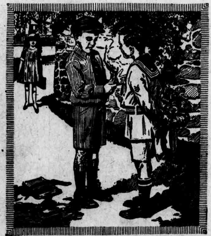
Special Showing of Tom Sawyers Superior Values

YOU will find in our line of Tom Sawyer Suits, Shirts and Blouses, washwear which is correct for every occasion—school, dress or play. Models include Norfolk, Russians, Broadfalls, Rompers, Play Suits, Shirts, Blouses and others. They are made of materials which wear long under the severest usage. All colors are tub fast and sun fast. Correct in design and workmanship, they fit properly and retain their smartly tailored look. Come in and select from the complete line