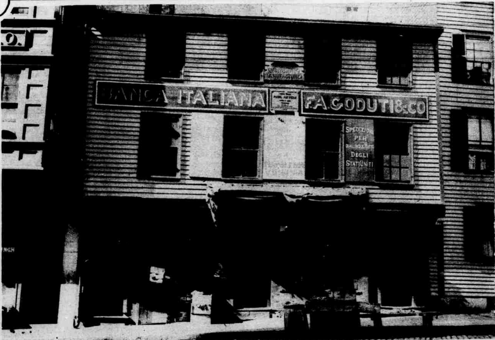
The Old Revere Blacksmith Shop