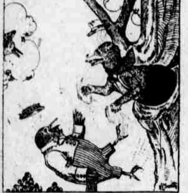
That fat Robin boy—he'll be caught! she wailed.

"If they don't look out they'll scare all the alewives back into their holes," he grumbled—a remark