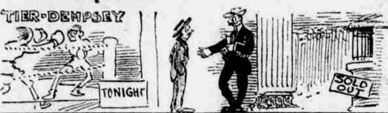
THE ONLY PLACE TO AVOID 'EM.