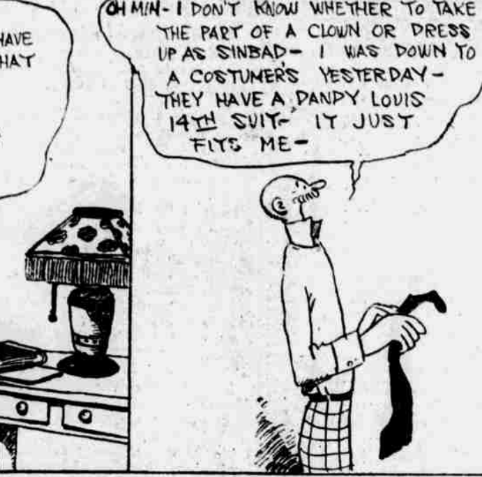
OH MIN—I DON'T KNOW WHETHER TO TAKE THE PART OF A CLOWN OR DRESS UP AS SINBAD—I WAS DOWN TO A COSTUMERS YESTERDAY— THEY HAVE A DANDY LOUIS 14TH SUIT— IT JUST FLYS ME—