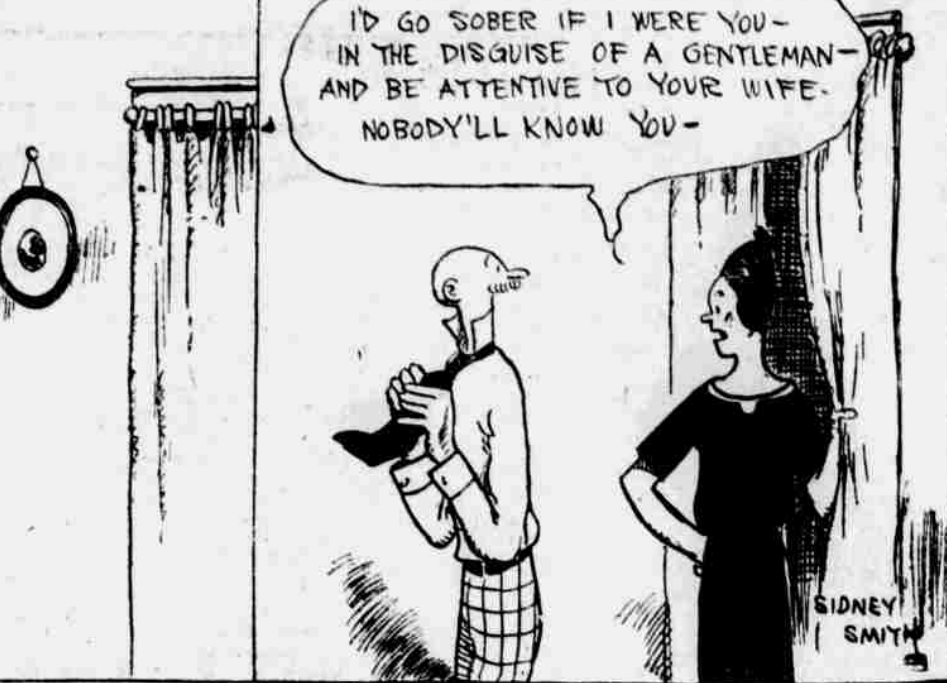
How WILL I Go?