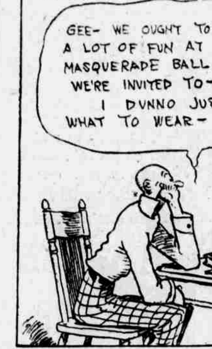
GEE—WE OUGHT TO HAVE A LOT OF FUN AT THAT MASQUERADE BALL WE'RE INVITED TO— I DUNNO JUST WHAT TO WEAR—

Copyright, 1921, by The Tribune Company, Chicago, Ill.