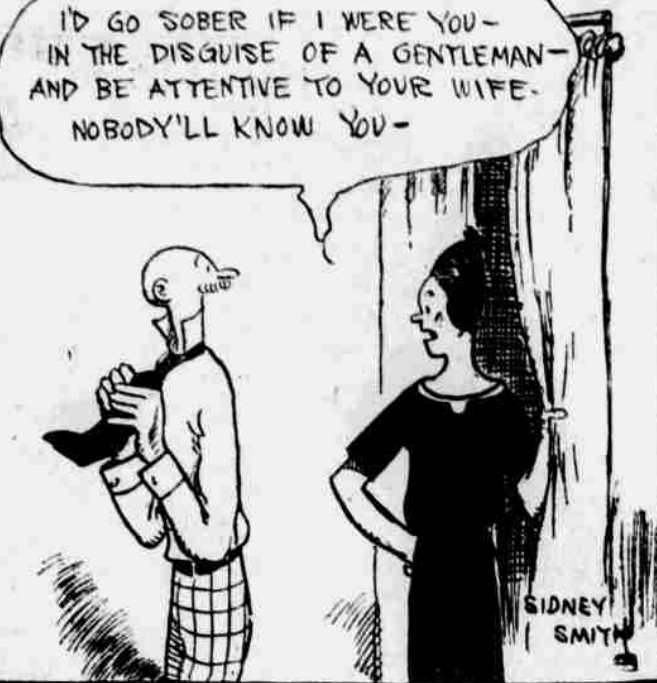
IT'D GO SOBER IF I WERE YOU— IN THE DISGUISE OF A GENTLEMAN— AND BE ATTENTIVE TO YOUR WIFE— NOBODY'LL KNOW YOU—