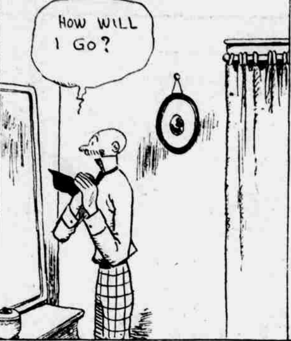
How WILL I Go?