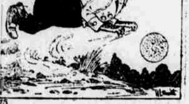
Tommy Fox would not be killed the next morning.

"No!" he said. "That cul's so tricky there's no knowing when he'll