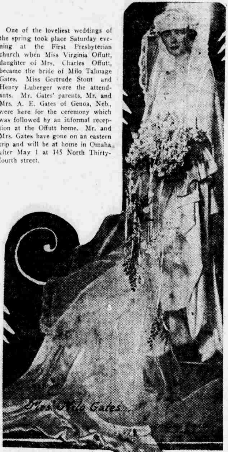
Rhinehart-Marsden Home Portrait.