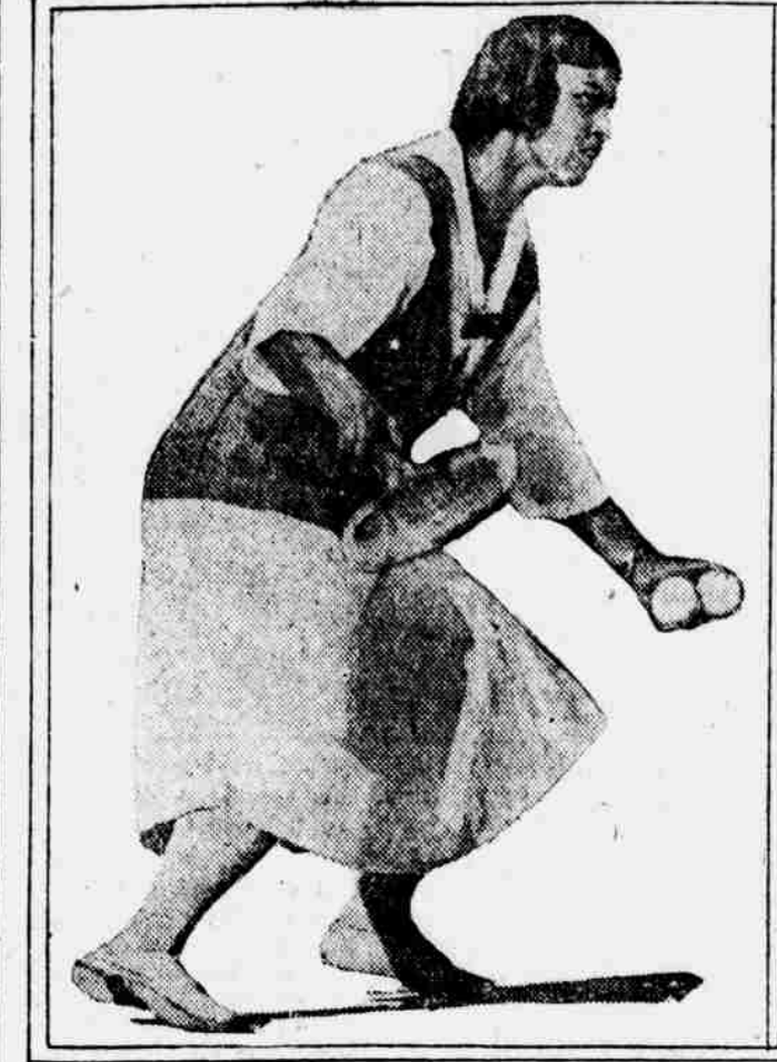
MRS. FRANKLIN MALLORY (nee Molla Bjurstedt), Women's champion.

Official ranking in United States tennis names Tilden, Johnston, Griffin and Mrs. Mallory as country's best.