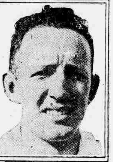
WILLIAM M. JOHNSTON, Doubles champion.