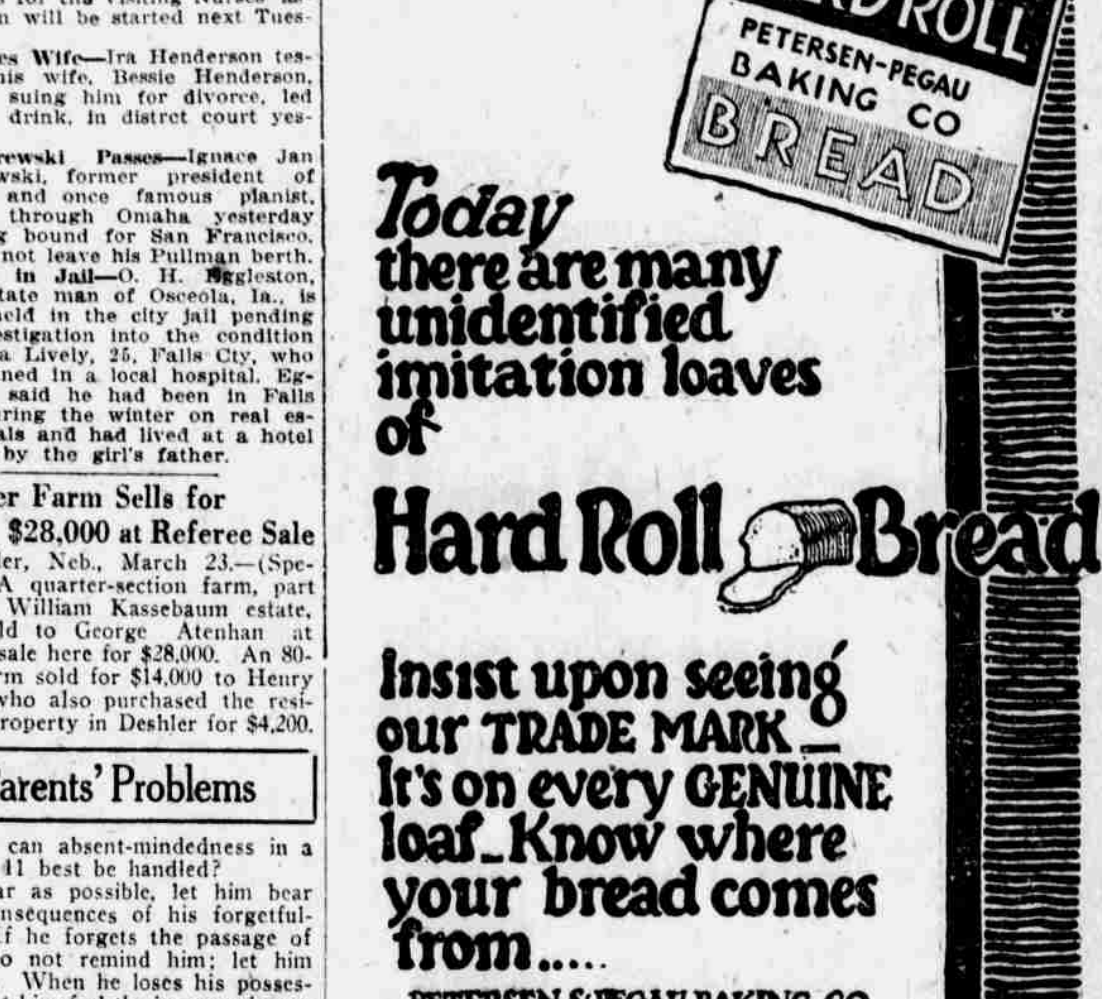
PETERSEN & PEGAU BAKING CO.

him a little about the handicap such a fault is and will be; and suggest