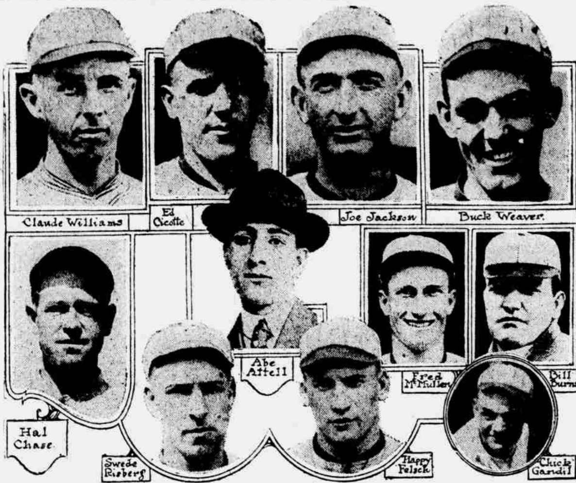
The cases against the indicted White Sox ball players for the alleged throwing of games in the world series of 1919 were dismissed by the prosecution today following the refusal to the trial judge to grant more than a 60 days' continuance sought by the state. The only indictment which was not dismissed was the one against "Chick" Gandil.