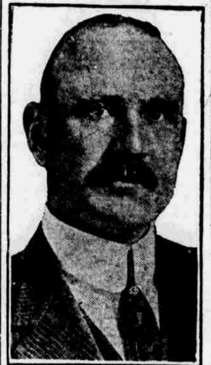
MR. C. W. NASH

C. W. Nash, Kenosha, Wis., head of the Nash and Lafayette factories, will be in Omaha Thursday and will be entertained at a dinner Thursday at the Rome hotel which will be attended by all middle-western dealers in Nash and Lafayette cars. The Lafayette four-passenger coupe, $7,620, in blue, and furnished in brocade velvet, sterling silver appointments, four doors, absolutely dust-proof appliances, and traveling trunk in the rear, is one of the features of the auto show. A stock Lafayette chassis, not made especially for exhibition purposes, is also on display.