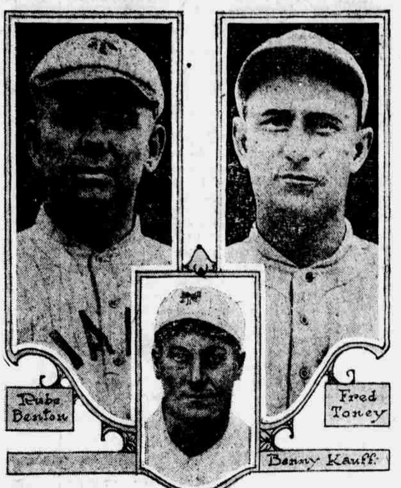
Benny Kauff, Rube Benton and Fred Toney, of the New York Giants, have been named in an affidavit filed in New York by "Heinie" Zimmerman, former third baseman of the Giants. Zimmerman had refused, obstinately, to discuss his dismissal from base ball two years ago, and his own statement has created quite a stir. In his statement he declares that during the last western trip of the Giants in 1919 he carried a bribe message to the three players named. They, according to his statement, were to receive $100 each if the Giants lost a certain game. Zimmerman admits in his statement his own guilt in that he carried the message, but declares that he was made the "goat" to save others on the New York team.