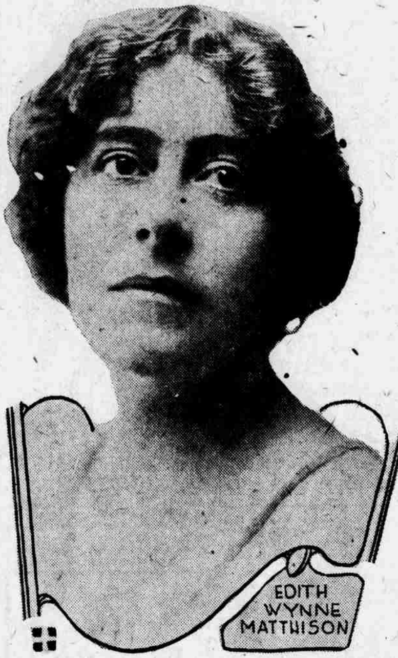
EDITH WYNNE MATTHISON