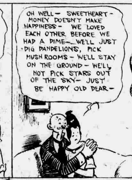
OH WELL—SWEETHEART—MONEY DOESN'T MAKE HAPPINESS—WE LOVED EACH OTHER BEFORE WE HAD A DIME—WE'LL JUST DIG DANDELIONS, PICK MUSH ROOMS—WE'LL STAY ON THE GROUND—WE'LL NOT PICK STARS OUT OF THE SKY—JUST BE HAPPY OLD DEAR—