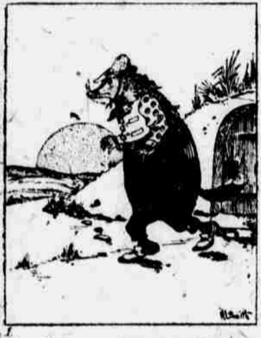
Usually no one saw Benny Badger except at night.

If any one had asked them, those little wild people would no doubt have confessed that they wished Benny Badger was somewhere else. But their wishes meant nothing to Benny.