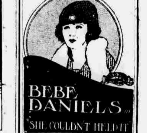
BEBE DANIELS SHE COULDN'T HELP IT

Strand STOPS WED. NIGHT Shows at 11-1-3-5-7 and 9