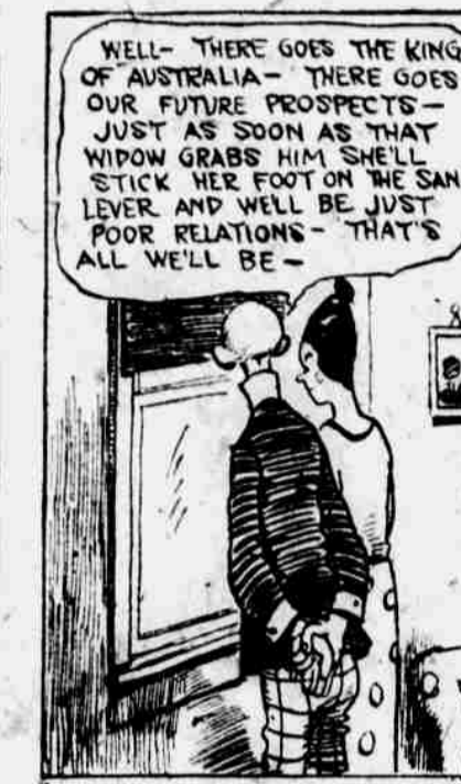
WELL—THERE GOES THE KING OF AUSTRALIA—THERE GOES OUR FUTURE PROSPECTS—JUST AS SOON AS THAT WIDOW GRABS HIM SHE'LL STICK HER FOOT ON THE SAND LEVER AND WE'LL BE JUST POOR RELATIONS—THAT'S ALL WE'LL BE—