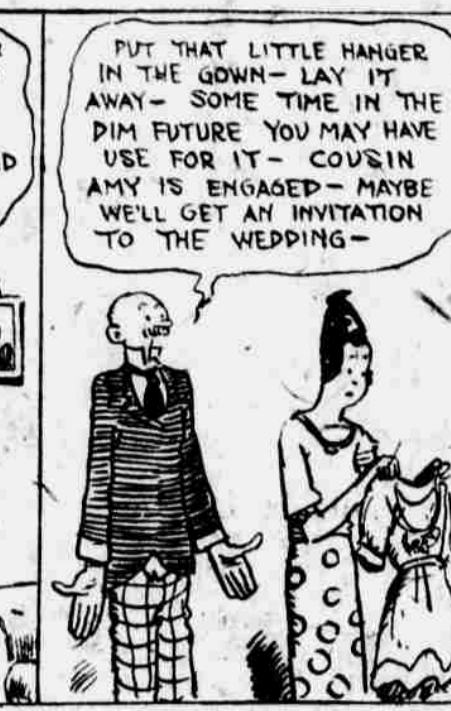
PUT THAT LITTLE HANGER IN THE GOWN—LAY IT AWAY—SOME TIME IN THE DIM FUTURE YOU MAY HAVE USE FOR IT—COUSIN AMY IS ENGAGED—MAYBE WE'LL GET AN INVITATION TO THE WEDDING—