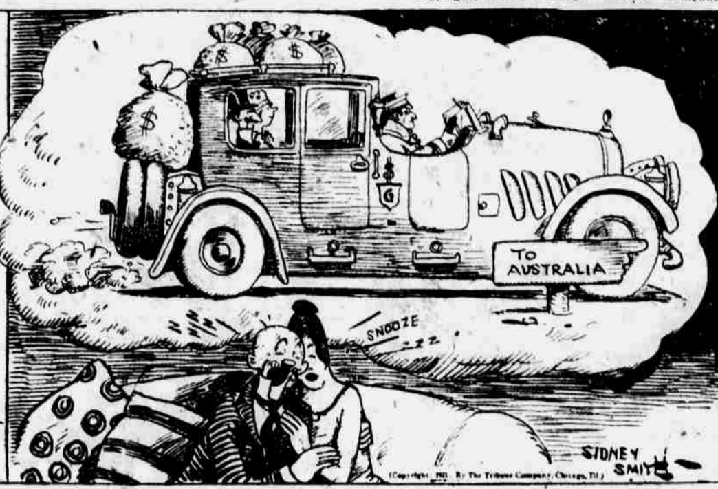
Drawn for The Bee by Sidney Smith. Copyright, 1921, Chicago Tribune Company.