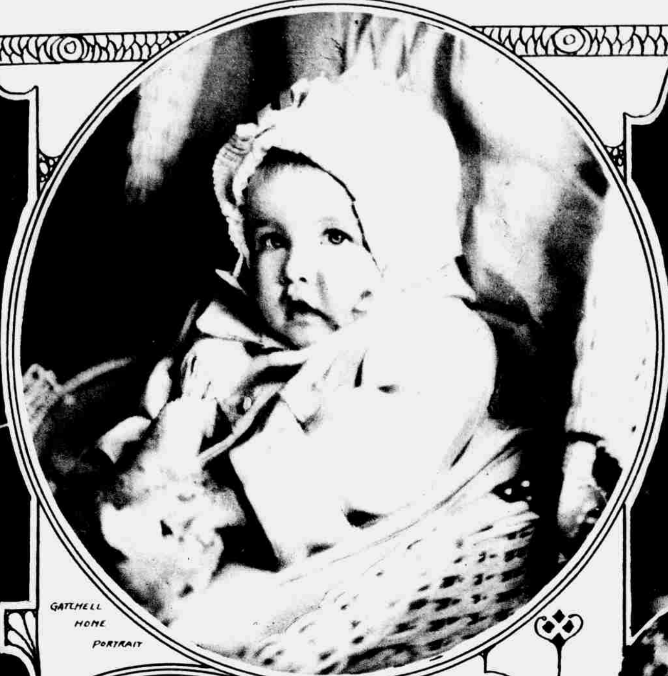
GATHELL HOME PORTRAIT