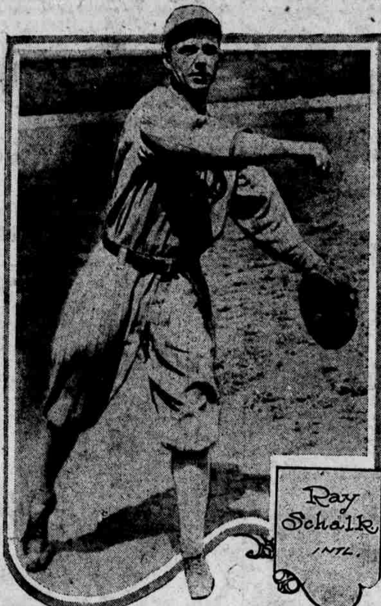
Ray Schalk, the clever receiver of the Chicago White Sox, for his eighth consecutive year leads the American league catchers with an average of .981. The little "crackler," as he is called, set another record for the 1920 season when he caught in 151 games. His nearest rival for hard work was Steve O'Neill of the Cleveland Indians, who worked in 148 games.