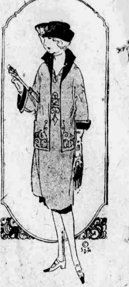
Imperative to Beauty of Frock Cut on the Redingote Line

Novel dresses in stiff moire have appeared in Paris. A frock of black crepe satin has sleeves of heavily embroidered black net. It is rumored that the ribbon sweater will be the vogue this summer. Muffs are seen again since so many women are wearing cloth coats. With the new suit coats are worn wide, crisp organdie frills in white or colors.