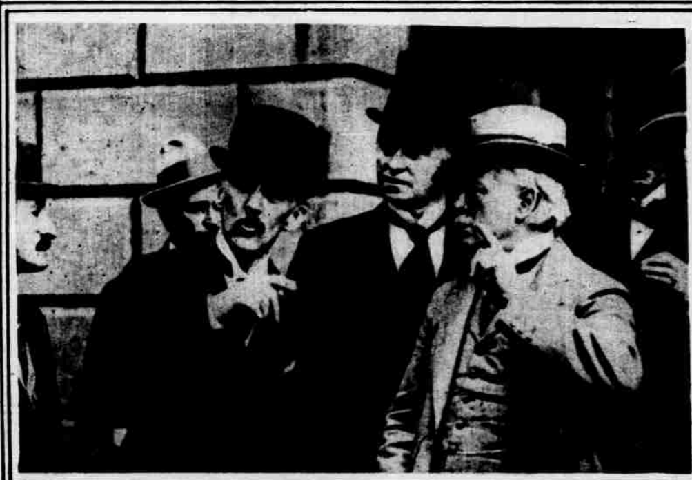
ENGLAND'S LEADER, Lloyd George, in serious conversation with President of League of Nations, Paul Hymans. Hymans is pointing one way, Lloyd George the other, and Lord Curzon, the referee, is standing behind, trying to decide who is right.