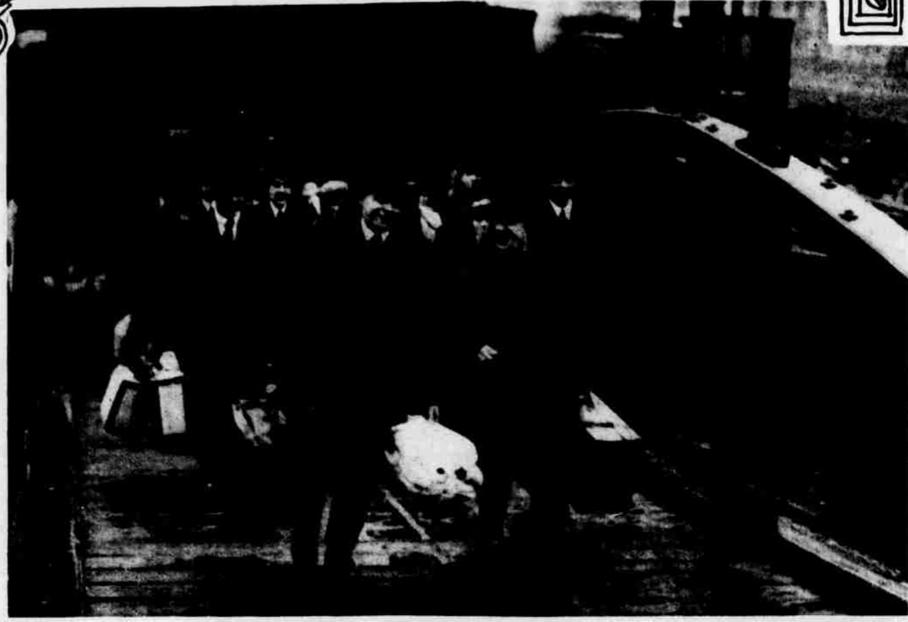
TWENTY-THREE ALLEGED COMMUNISTS boarding the ferry boat at the Barge Office, New York, to go to Ellis Island for deportation on the S. S. Imperator sailing for Europe. They were rounded up in various parts of the country and have been enjoying their freedom under bail. Nearly all are Russian.