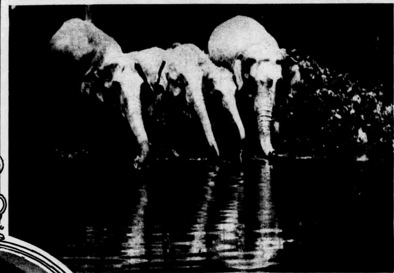
NO, THIS IS NOT DARKEST AFRICA —It is only "45 Minutes from Broadway," with the great elephants from the Hippodrome, out on a little outing. The photo was taken by George Powers, who attends to the welfare of the giants of the forest.