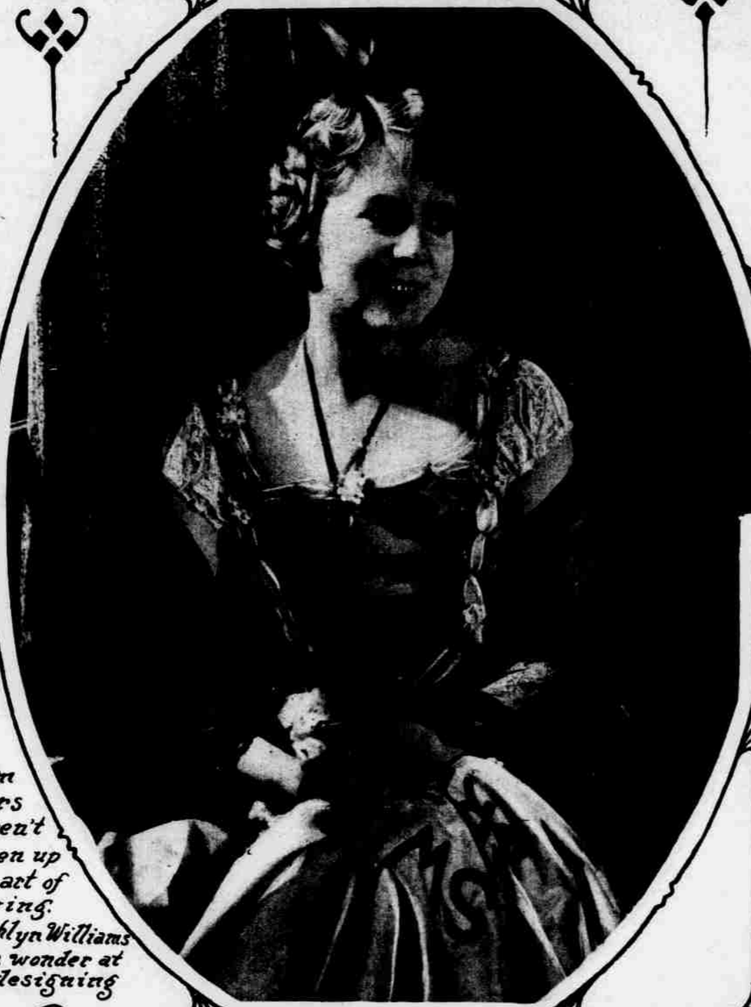
Film stars haven't given up the art of sewing. Kathlyn Williams is a wonder at designing