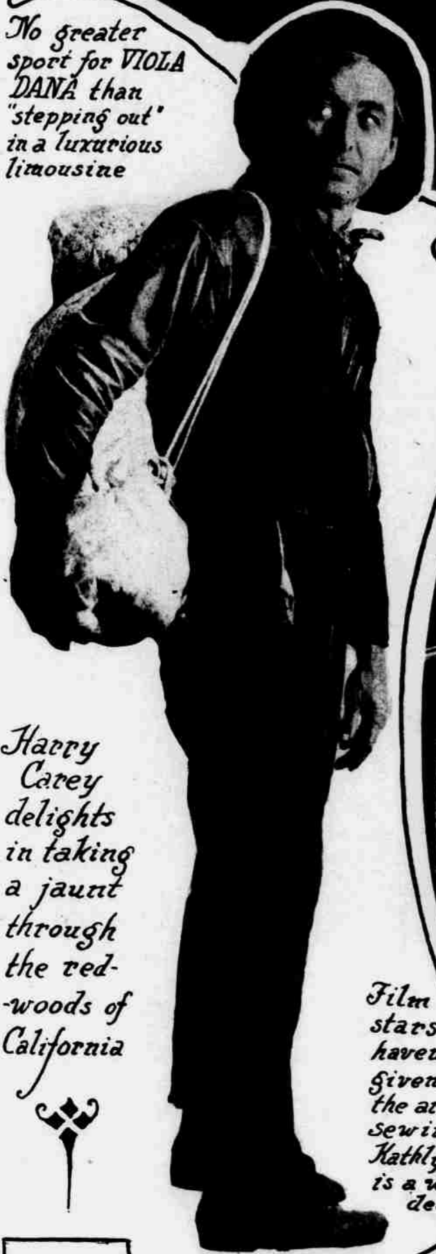
Harry Carey delights in taking a jaunt through the red-woods of California