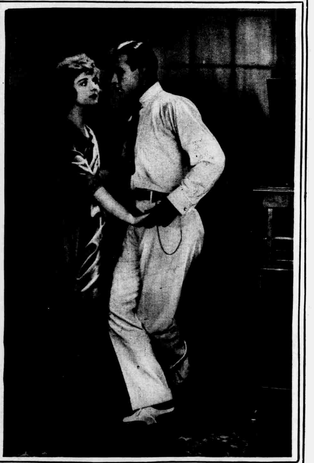
Rudolph Valentine and his dancing partner, Alice Terry, step off a few measures to some "wicked blues"