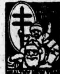
PLAY SAFE—Buy Christmas Seals!

Check Stand —Where you may check your luggage or packages, or may leave your wraps while shopping.