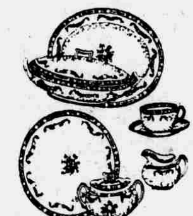
This Is Minton's Own Garland Pattern