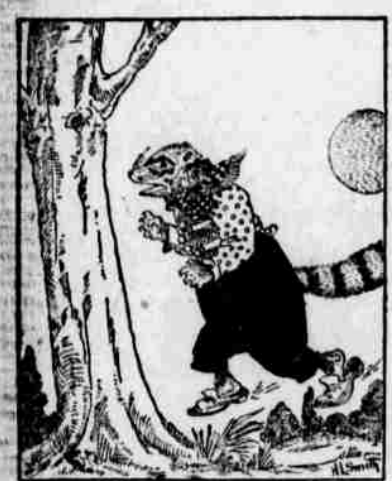
It was lucky for Fatty that he started when he did.

The very next night Fatty set out toward Farmer Green's. It was hardly dark. But Fatty could not wait any longer. He could not even wait for his brother. He hurried away alone. And when he came in sight of the cornfield he felt better. He had been the least bit afraid that the corn might be gone. He thought that maybe Farmer Green had picked it, or that some of the forest people had eaten it all. But there it was—a forest of corn waving and rustling in the moonlight as the breeze