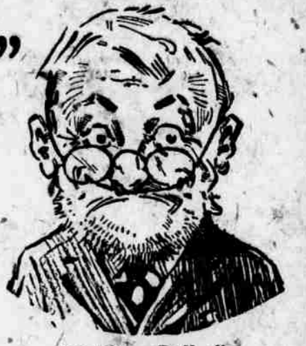
"Old Man Dollar"