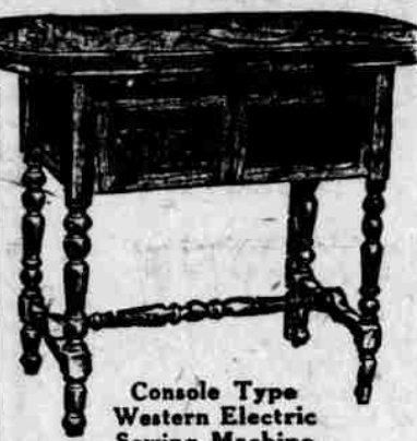
Console Type Western Electric Sewing Machine