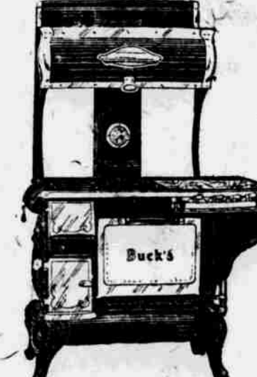
Buck's modern combination stove, full nickel trimmed.