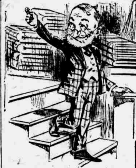
Old Man Dollar

This is "Go to Movie" Week When "Old Man Dollar" Appears on the Screen