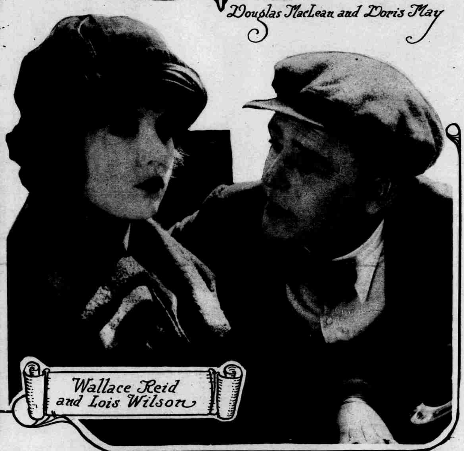
Wallace Reid and Lois Wilson