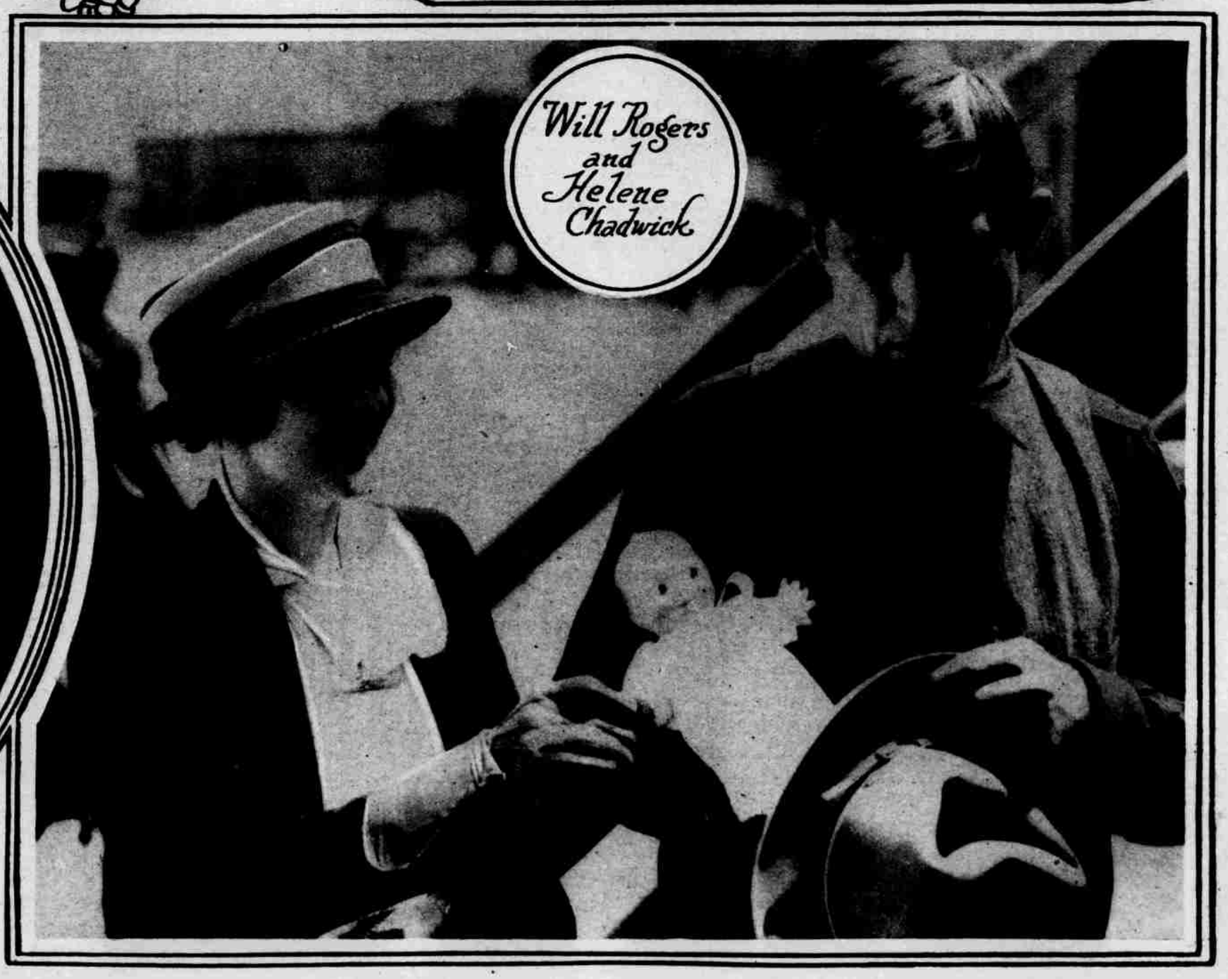
Will Rogers and Helene Chadwick