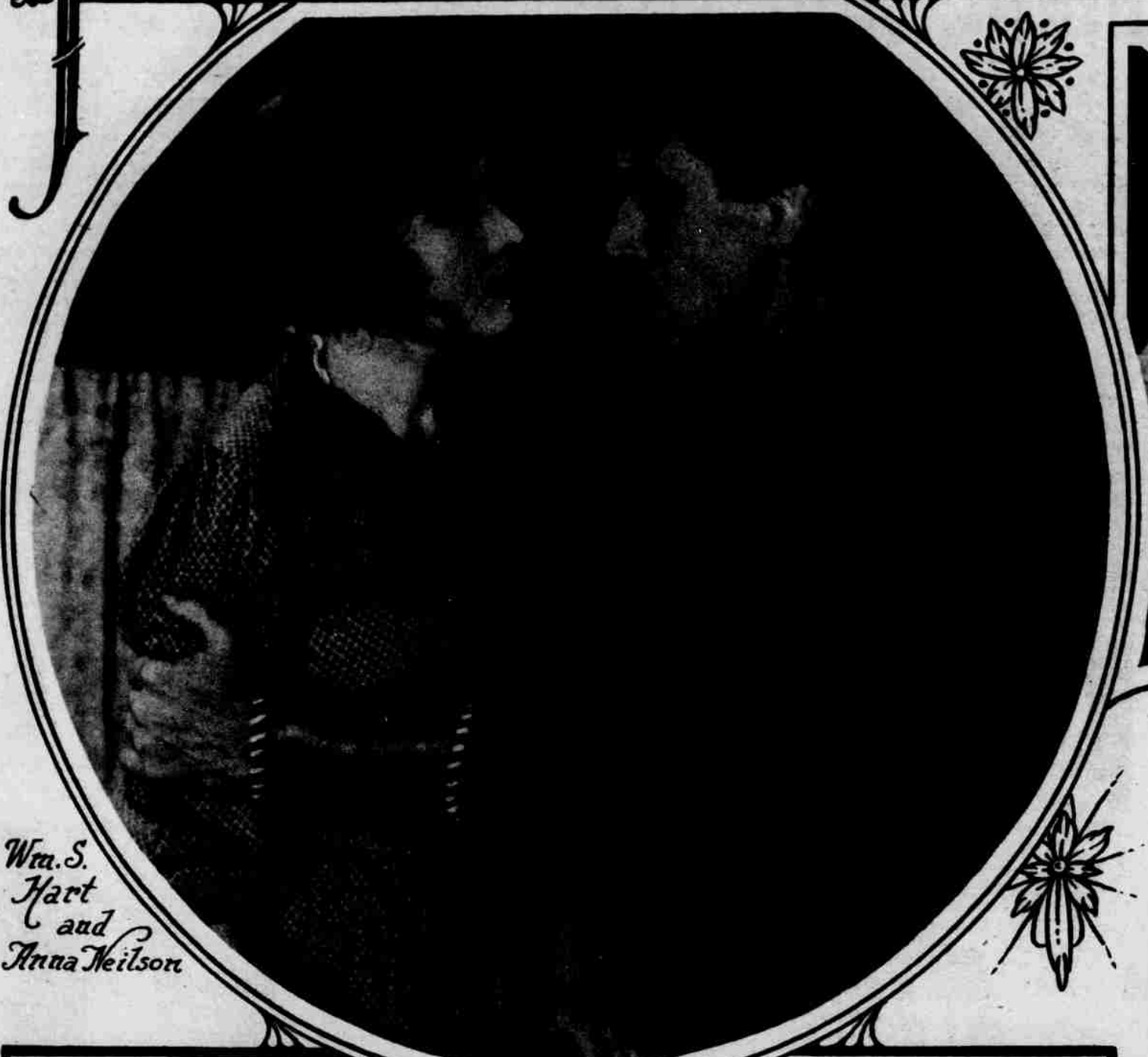
Wm. S. Hart and Anna Neilson