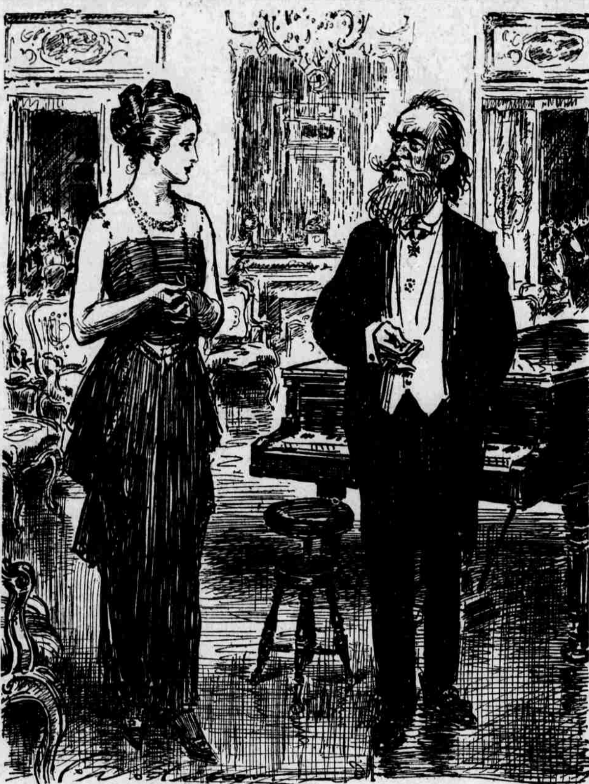
—Published by Arrangement With Life.

By Charles Dana Gibson Copyright Life Pub. Co.