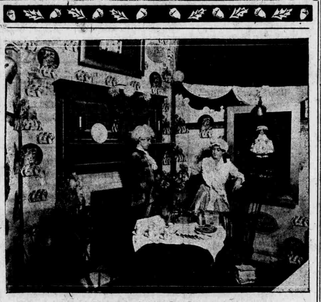
Jay Burns Bakery Co. booth typifies Betsy Ross and colonial times.