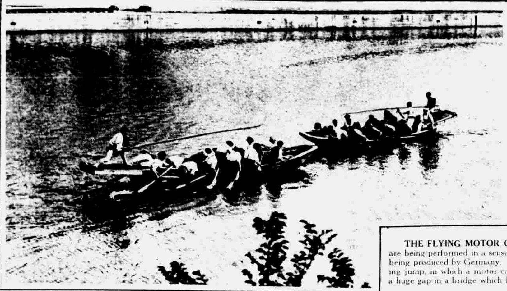
NEW FRENCH WATER SPORT, DANGEROUS BUT EXCITING— In a special built boat with 13 to a side, the captain who is the most powerful in the crew is armed with a long pole and struggles with his opponent to throw him overboard. The only protection against the pole is a chest shield. The photo shows the boats heading on for each other at full speed.