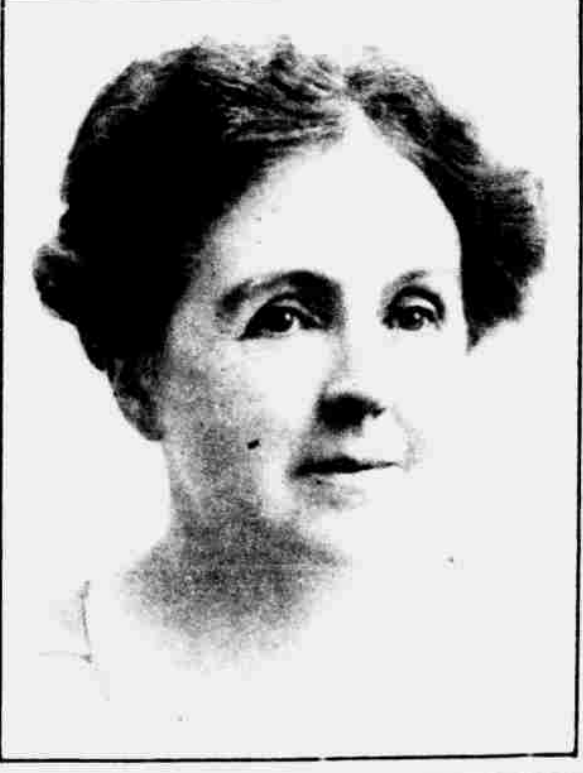
MRS. LLOYD GEORGE HONORED —The latest portrait of Mrs. Lloyd George, wife of the Premier, who has had the Order of Dame Grand Cross of the British Empire conferred upon her. The honor is conferred in recognition of the many services rendered by Mrs. George during the war in connection with war charities, hospitals, etc.

Patrick DULUTH TRADE MARK REG. U.S. PAT. OFF.