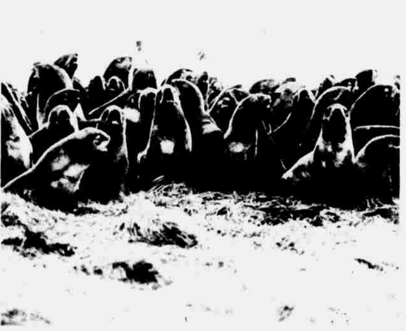
CENSUS OF SEALS EXPECTED TO SHOW ABOUT 600,000, WORTH $84,000,000 —Under control by Uncle Sam, the animal "count of noses" is of importance to prevent "blind killings" of the animals for their furs, possibly resulting in their extinction. Under the present government control, the seals are increasing 10 to 12 per cent of their number annually. The photo shows taking the count at St. George Island, Bering Sea.