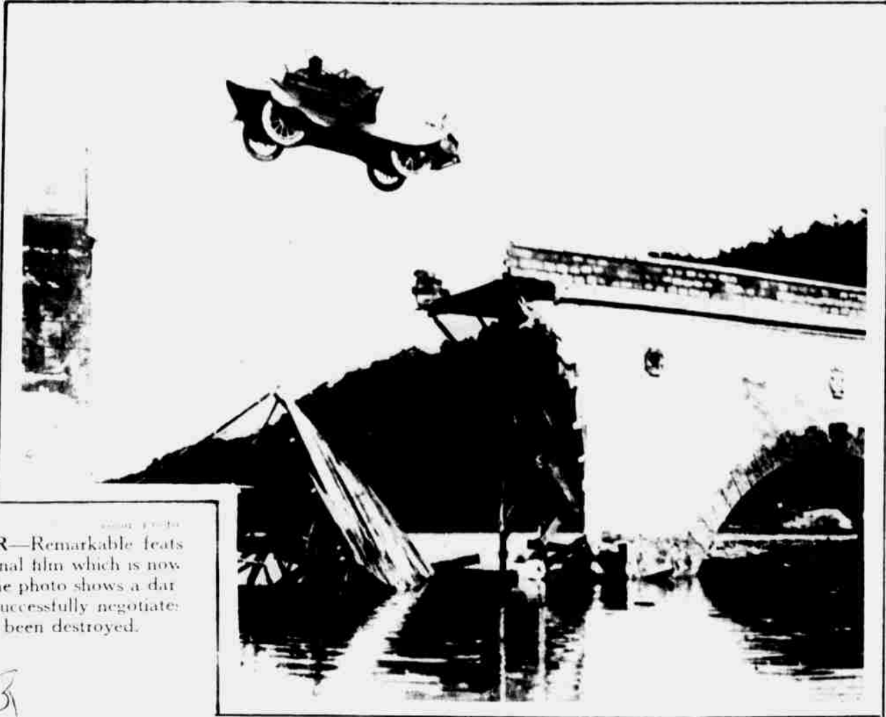
THE FLYING MOTOR CAR —Remarkable feats are being performed in a sensational film which is now being produced by Germany. The photo shows a daring jump, in which a motor car successfully negotiates a huge gap in a bridge which has been destroyed.