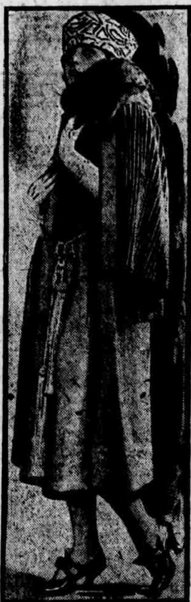
Fashion Camera Photo

French women, who know so well how to dress charmingly on a little money, are well aware of the value of the postillion cape coat in their wardrobes. There must be at least one, for it will insure style even in the moment. This one is of gray wool jersey cloth, long and semi-fitting under the cape effect. The latter is accented by a wide band of loose from the roll collar sides and back, the front free. With a fur piece, a chick turban of the same shade braided in gold or silver and a silver of gold cord with long tassels to confine the coat, it is a costume royal.