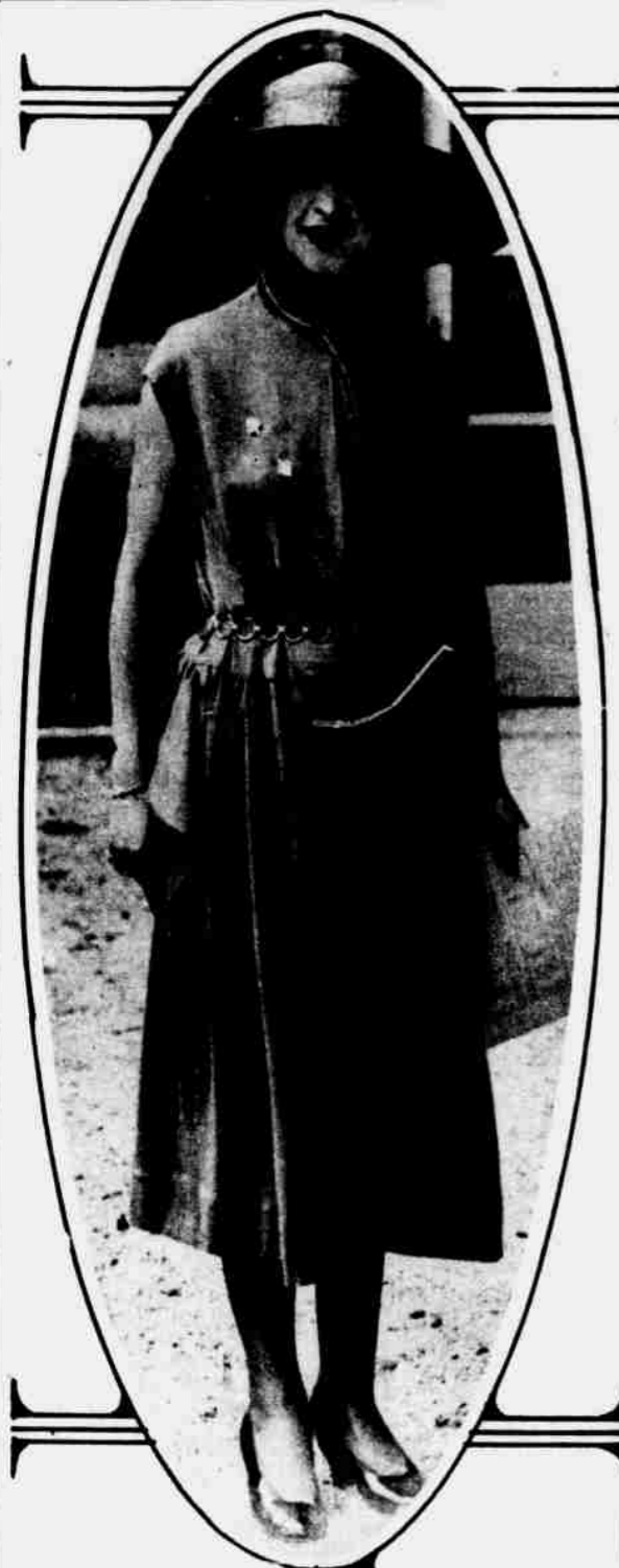
"WHY BOTHER ABOUT SLEEVES AT ALL?" reasons Mademoiselle after a season most stingy of arm coverings. But the textile manufacturers and modistes must live, so the quarter of a yard of sleeve material she gathers around her neck and hastens forth to the races at fashionable Deauville. And behold the latest French fashion is born.