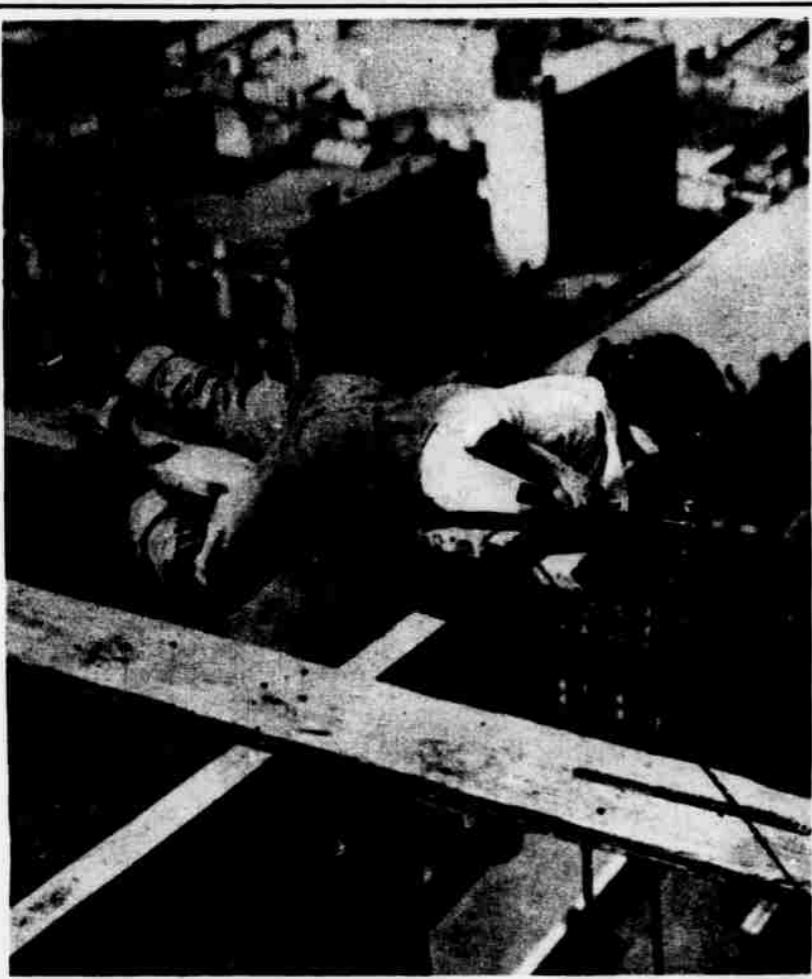
VOTES FOR WOMEN! The young lady in overalls shaking a mean hammer high above Chicago's streets is a reporter for an afternoon newspaper out, or rather up, after local color, on the thrills of being a day laborer in America's second largest city. Since "truth is stranger than fiction" her story ought to have been a good one.

Raiduff Egyptian Chocolates The choice of exacting candy lovers. FLAVORS THAT SATISFY Sold at most good shops.