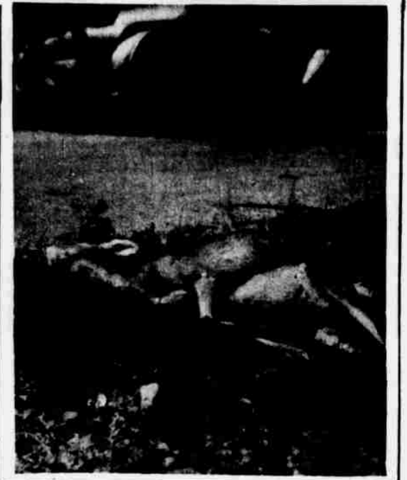
KILLED OUT OF SEASON, but not by a hunter's gun. This little yearling doe had seen so many autos go whizzing by her on the wonderful highways of the Adirondacks she carelessly jumped in front of a pair of dazzling headlights one night. History doesn't tell us what happened to the motorist and his speeding juggernaut.