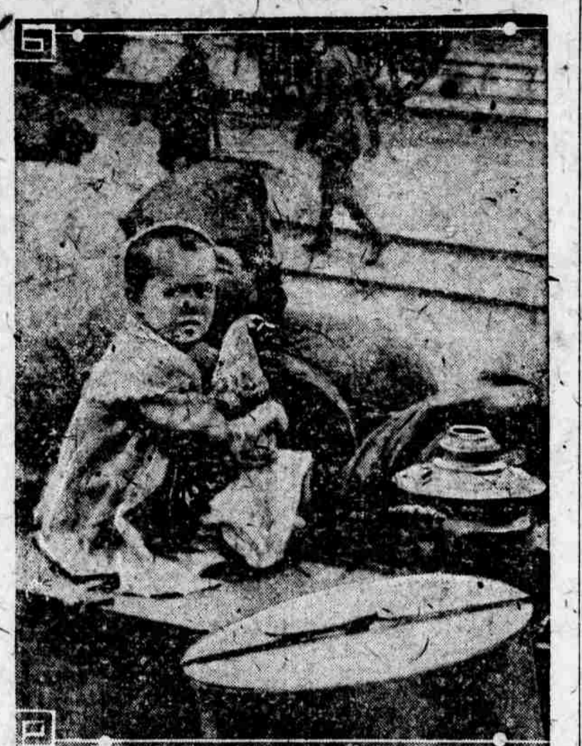
This Polish kiddie, when his people fled from Kiev, made sure his pet hen was safe. This youngster, like many others, had to flee for their lives when the bolsheviks descended upon the city.