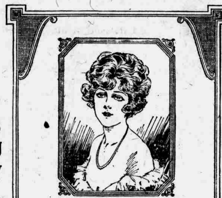
For the Adornment of Beauty—La Tausca Pearls

We are doing this right now—cutting the price in two on our beautiful selection of La Tausca, Richelieu and Blue Beard Pearl Necklaces.