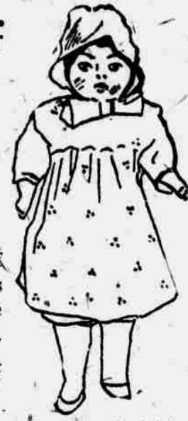
Horsman, Rauleigh, Kestner, large size

Together with this purchase, we bought from a broker, representing railroad companies, thousands of imported dolls received in this country too late for last Christmas business and refused by the buyers.