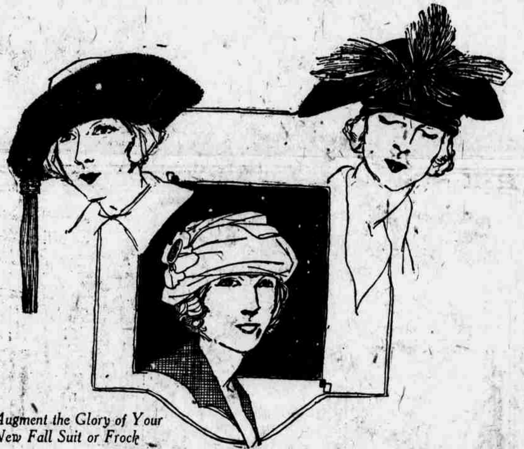
To Augment the Glory of Your New Fall Suit or Frock