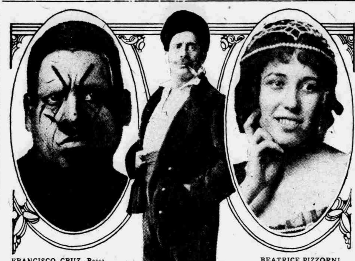
BEATRICE PIZZORNI Dramatic Soprano.