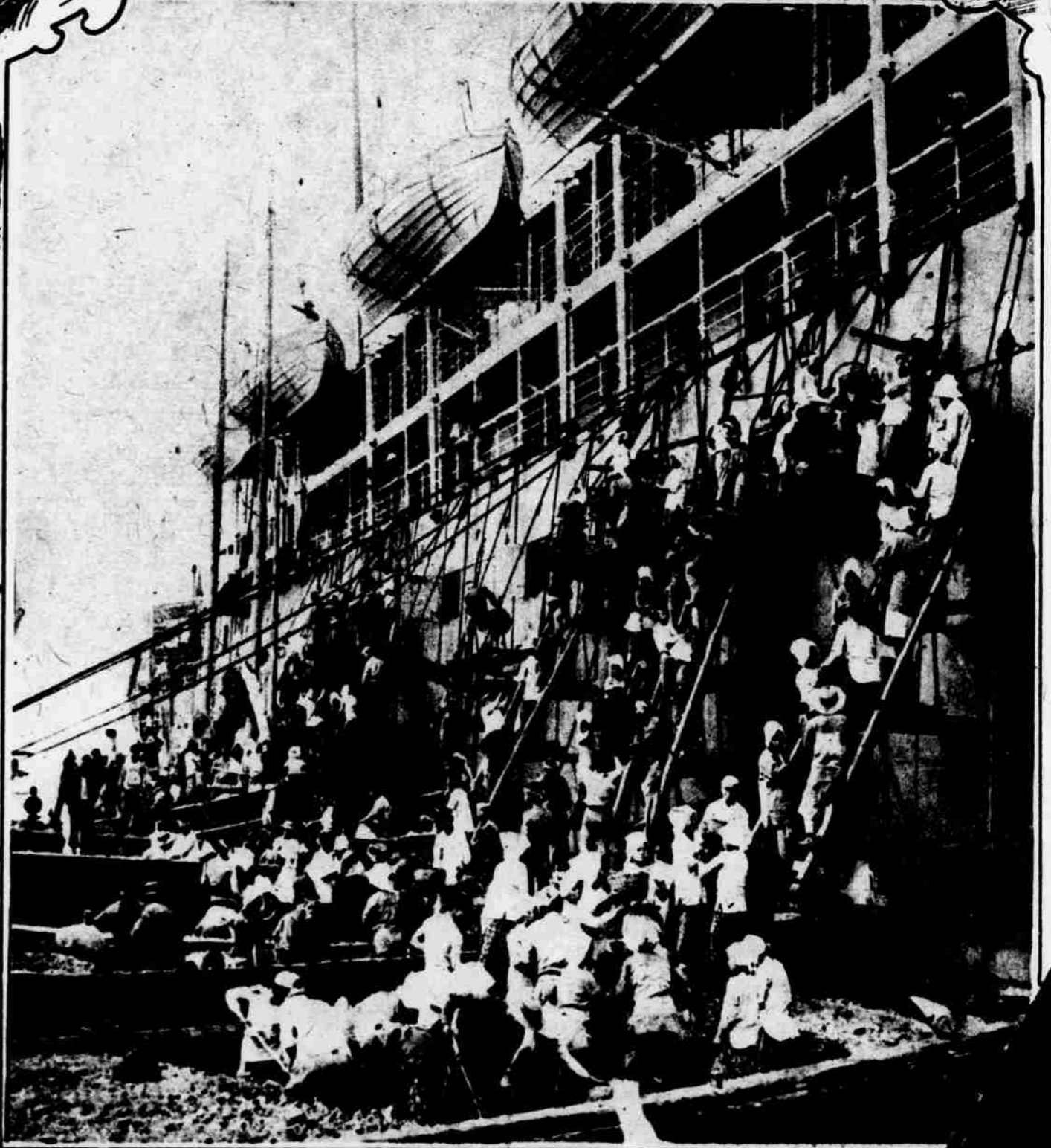
WOMEN COALING STEAMER AT NAGASAKI, JAPAN.