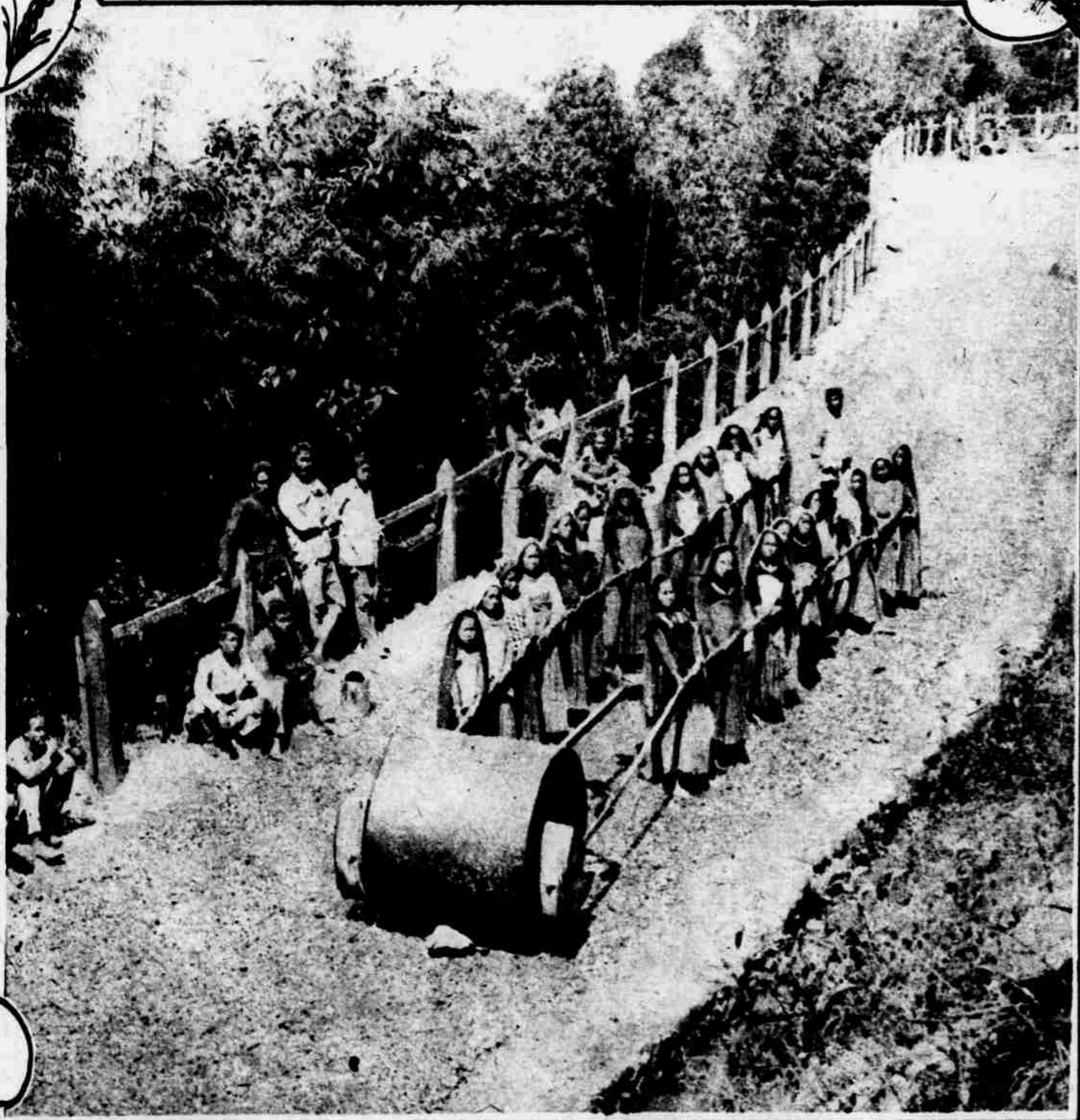
TWENTY WOMAN TEAM ON A DARJEELING HIGHWAY.