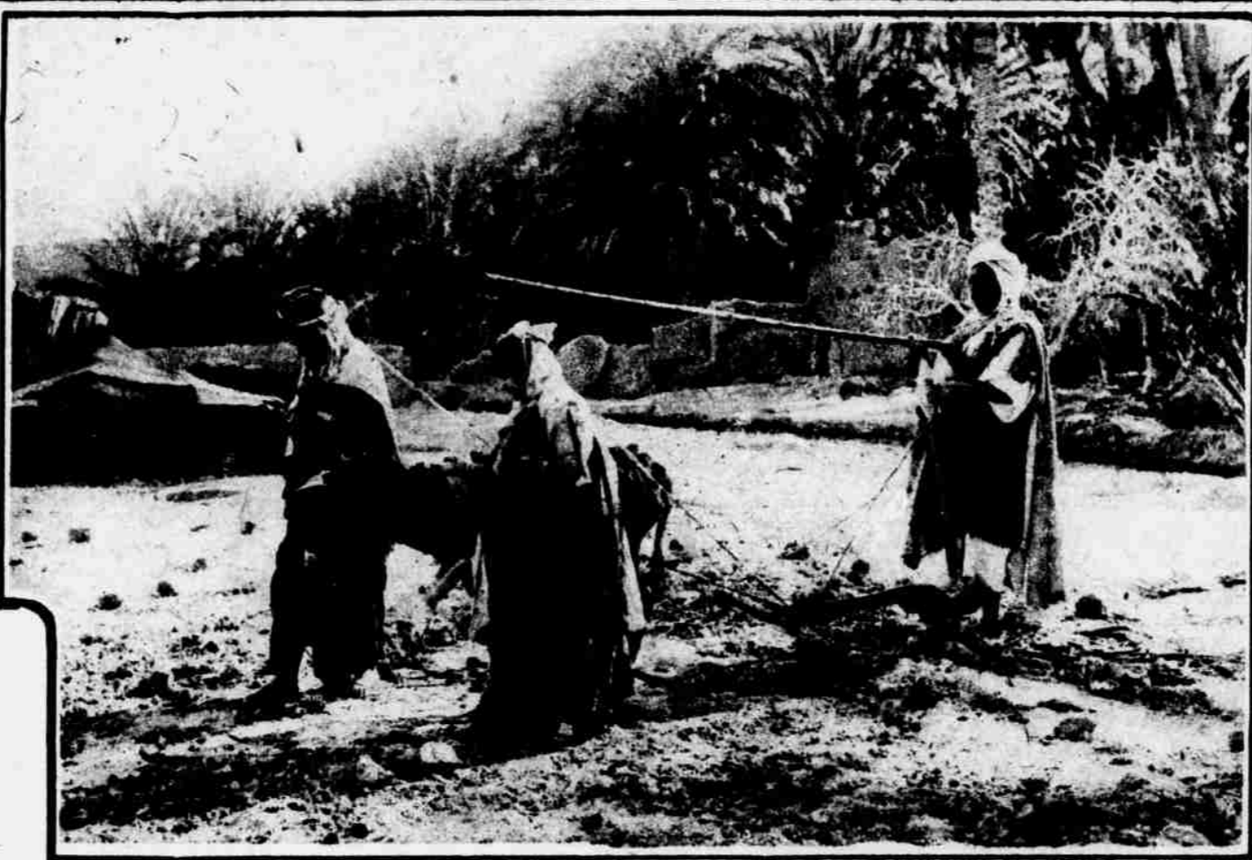
In the Barbary States, men have found it cheaper to get rid of their mules and horses and hitch their women folks to plows and carts. In Turkey, women can be bought much cheaper than mules, so men have preferred to keep a large number of wives and sell their mules. The photo shows an Algerian farmer driving two of his women with a poor, almost starved donkey.