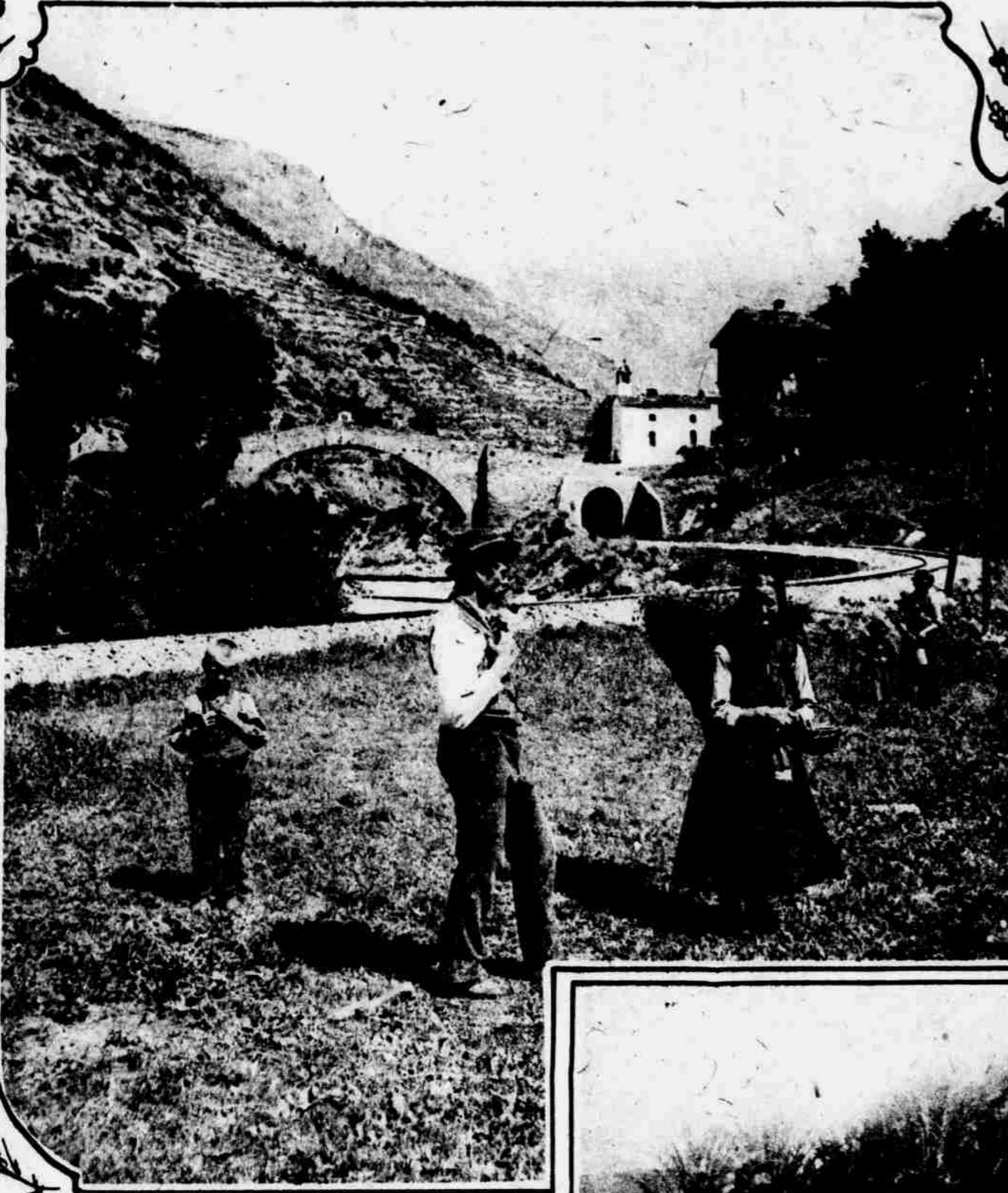
AN OCTOGENARIAN OF THE BURMESE ALPS, SWITZERLAND.